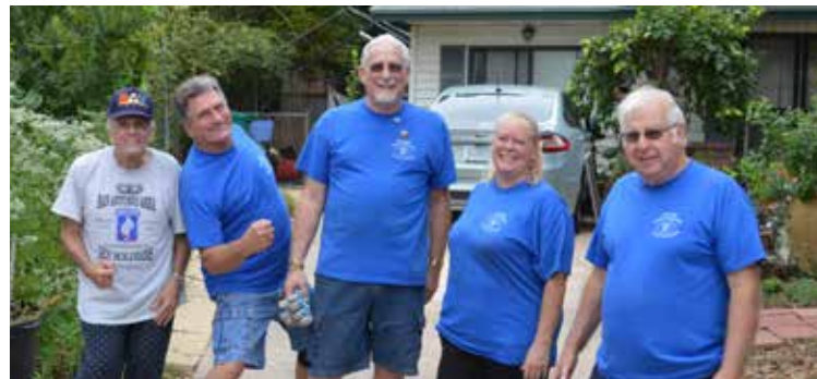
crew worked for four hours, filling dozens of trash bags that filled an entire bed of a pickup.