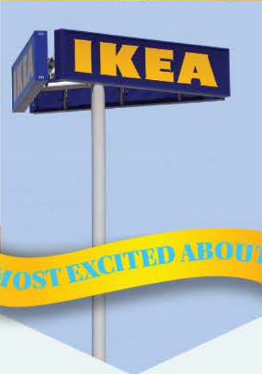
Live Oak Town Center