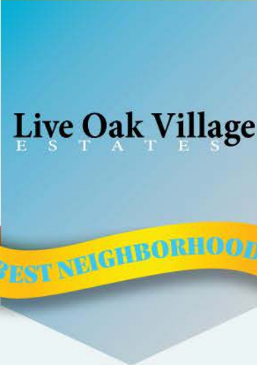
Live Oak Village Estates