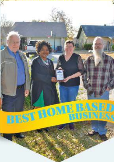
Armor All Leather