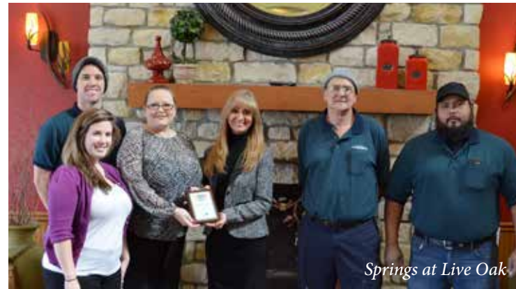
Springs at Live Oak