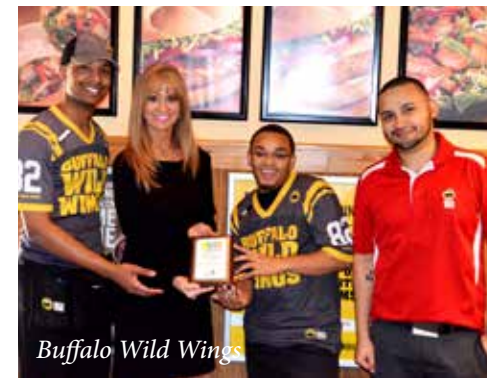
Buffalo Wild Wings