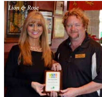
Lion & Rose