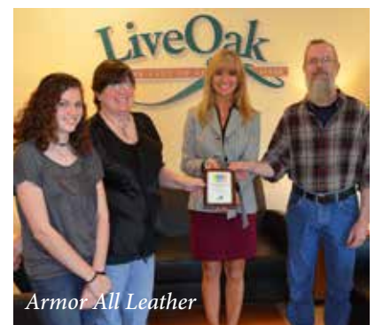
Armor All Leather