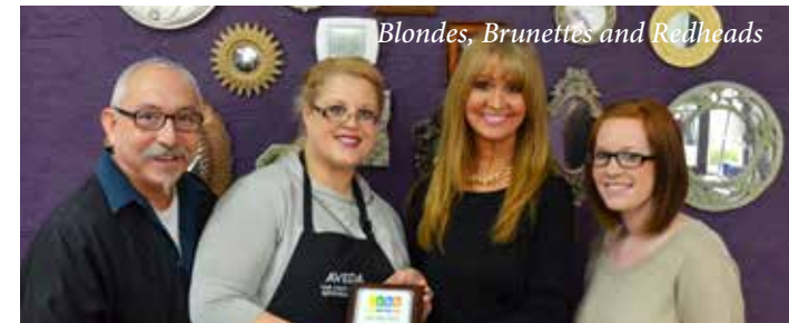
Blondes, Brunettes and Redheads