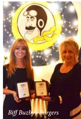
Biff Buzby's Burgers