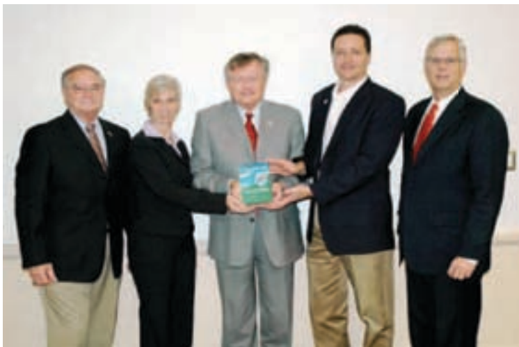
NE Lakeview College received an Economic Impact Award at the Austin - San Antonio Corridor Growth Summit.