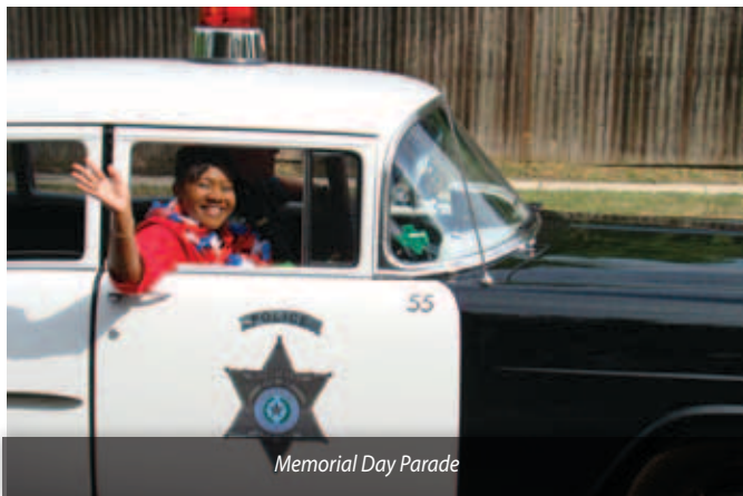
Memorial Day Parade

You can reach the City Hall: 210-653-9140 or my cell: 210-792-7168 or email me at yourmayormary@yahoo.com