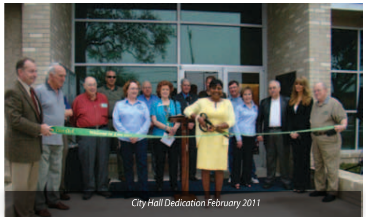
City Hall Dedication February 2011